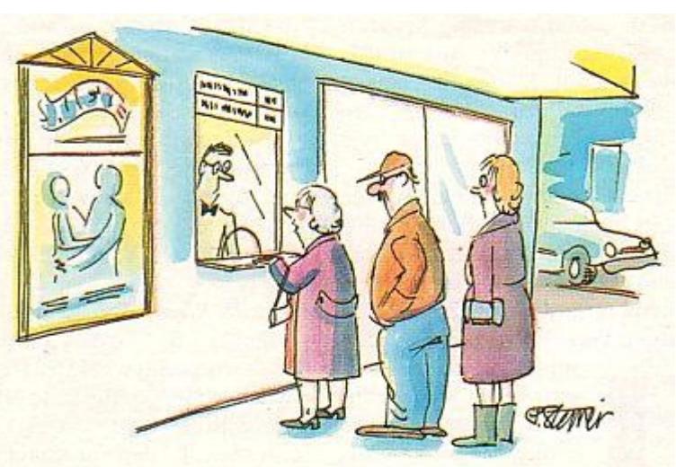
"One senior discount for the six o'clock show, and could you fill this prescription, please?"

Don't Forget FISH FOOD FRIDAY! Friday, June 6th at 1 PM FISH food will arrive in the dining room. Once you are registered, you get to build your own box with the food items available, and pick out fresh produce, all absolutely free! Don't forget to come down and take advantage of this service, conveniently brought to our community to supplement your food budget. Hope to see you there!